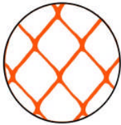
DLW or DM